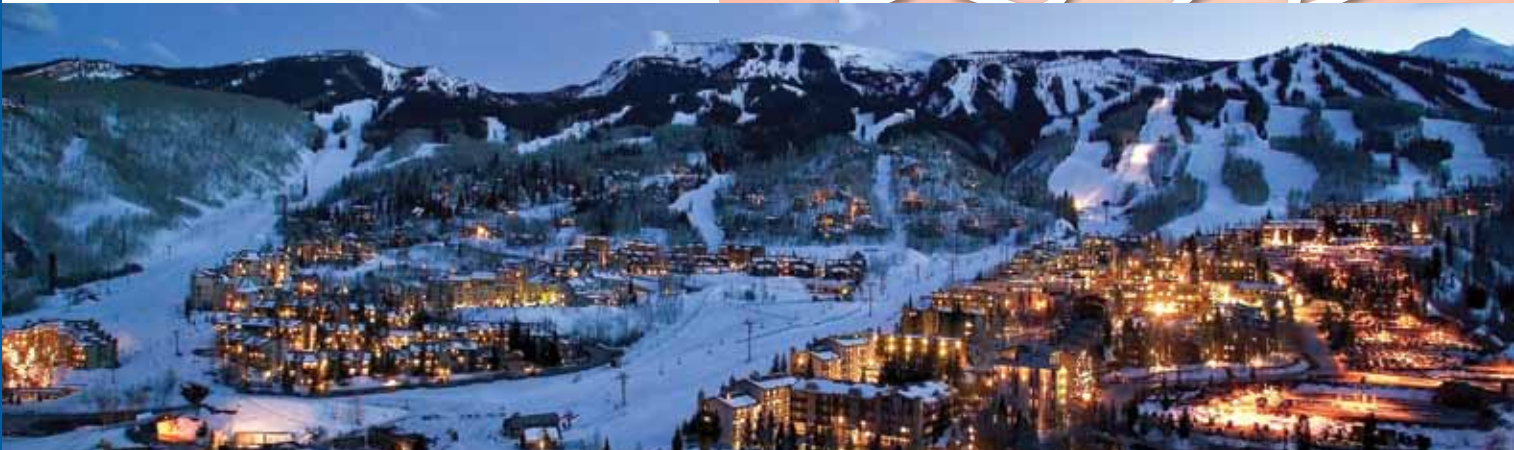
All prices are per person and include 7 nights accommodation & 6 day lift pass. BONUS 2000 Qantas frequent flyer points, conditions apply.