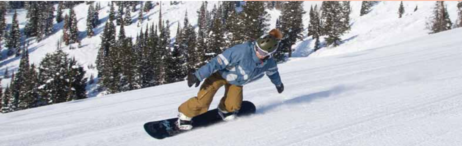
All prices are per person and include 7 nights accommodation & 6 day lift pass. BONUS 2000 Qantas frequent flyer points, conditions apply.