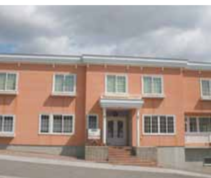
2 O SHARE NA MORI moderate

For accurate pricing, room selection & further information contact Skimax.